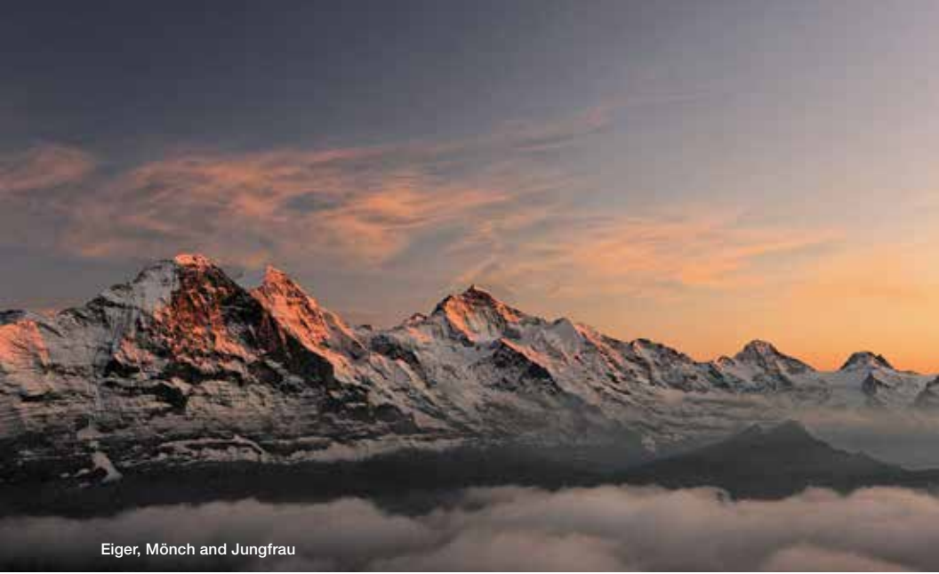
Eiger, Mönch and Jungfrau