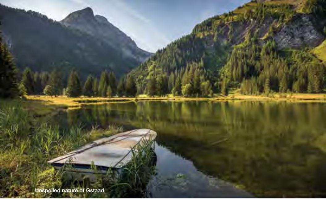
Unspoiled nature of Gstaad