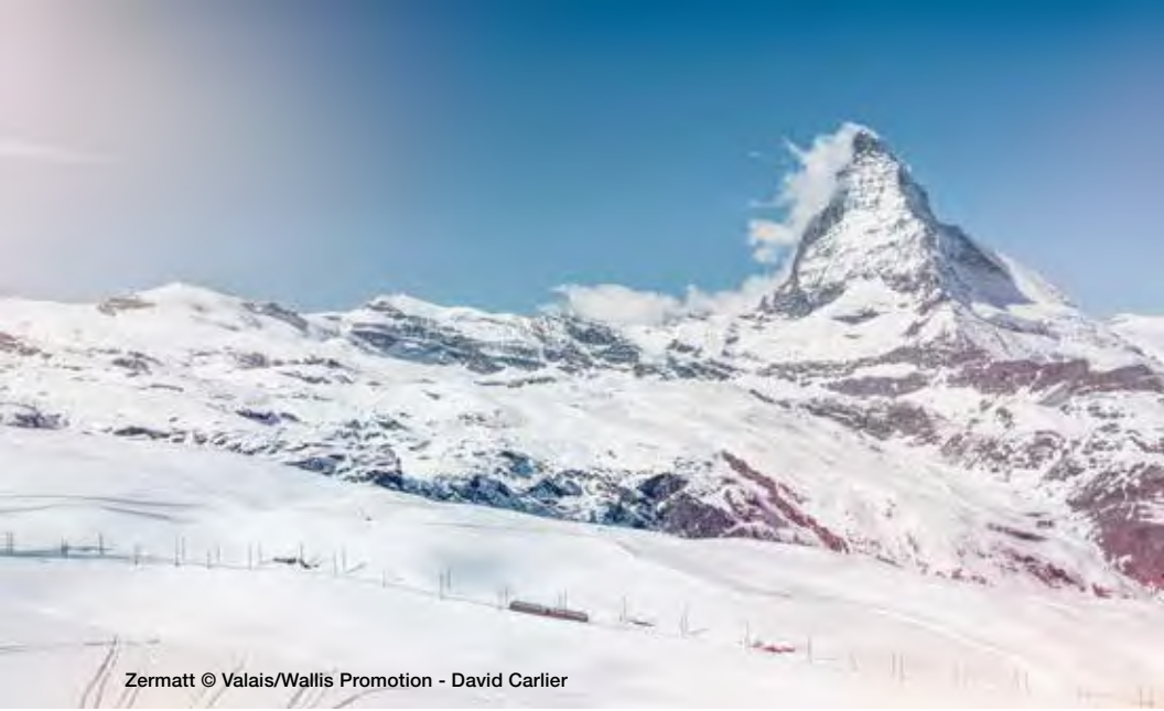
Zermatt