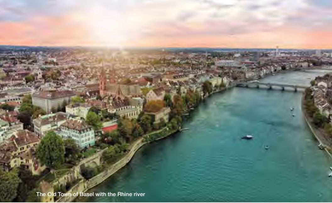
The Old Town of Basel with the Rhine river