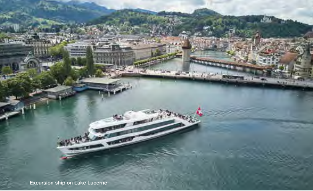
Excursion ship on Lake Lucerne