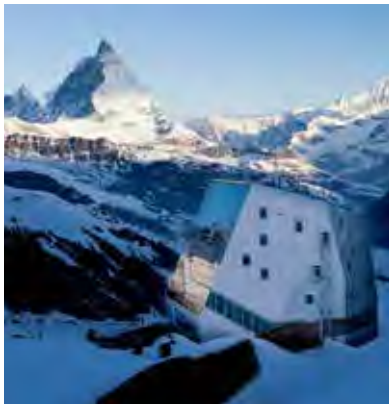
Monte-Rosa hut, Zermatt, Valais