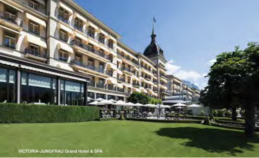
VICTORIA-JUNGFRAU Grand Hotel & SPA