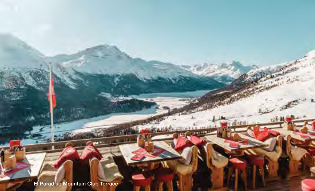
El Paradiso Mountain Club Terrace