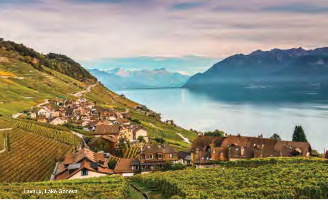
Lavaux, Lake Geneva