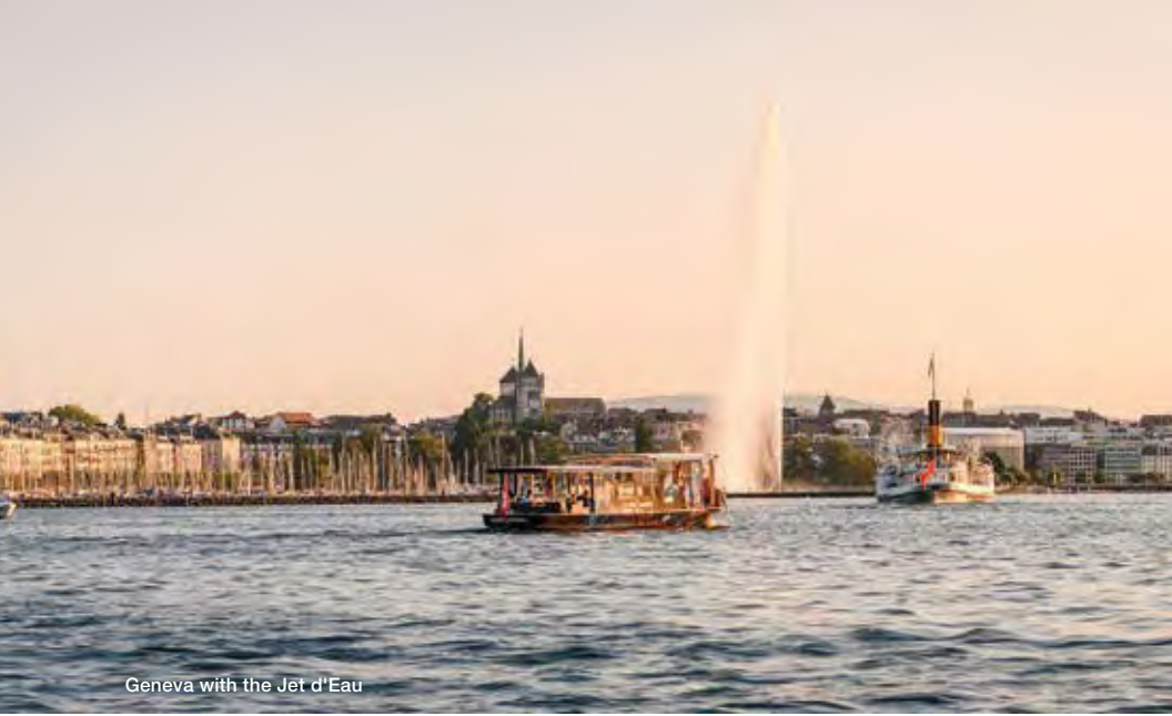
Geneva with the Jet d'Eau