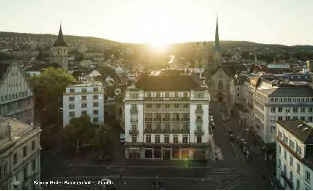
Savoy Hotel Baur en Ville, Zurich