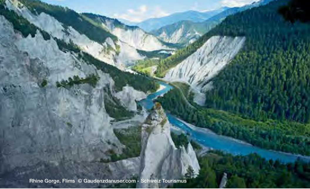
Rhine Gorge, Flims