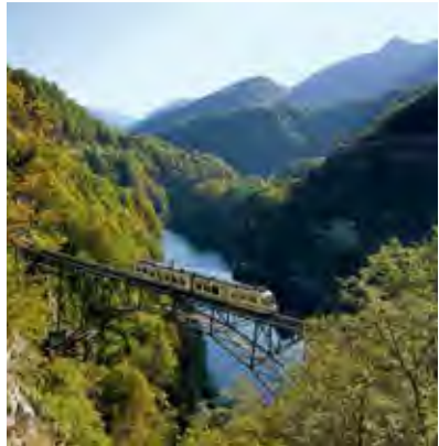
Camedo, Centovalli Railway, Ticino