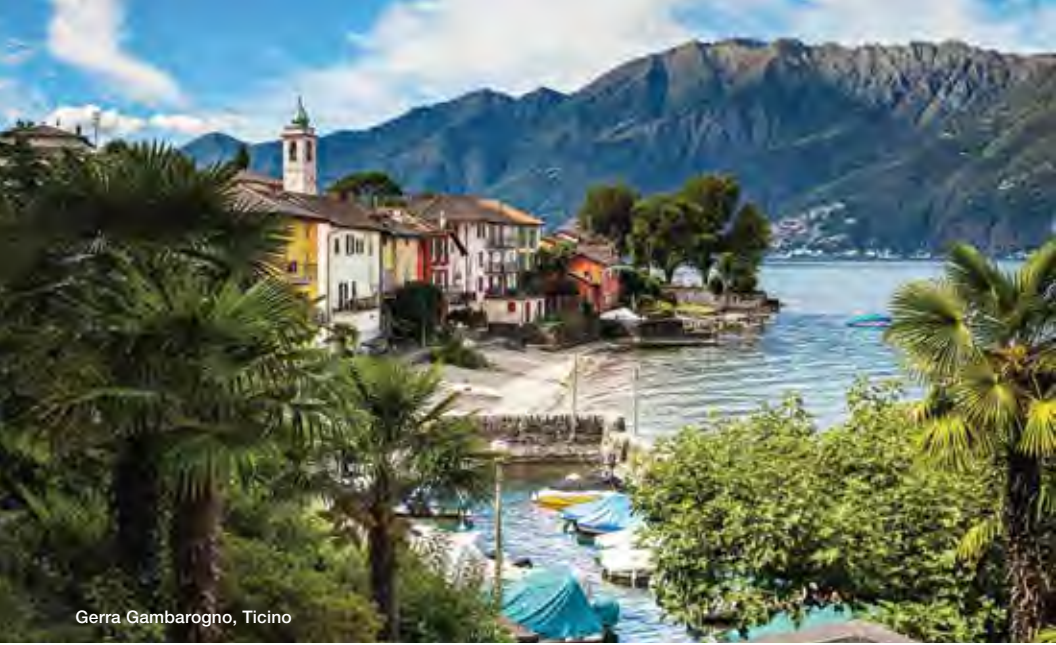
Gerra Gambarogno, Ticino