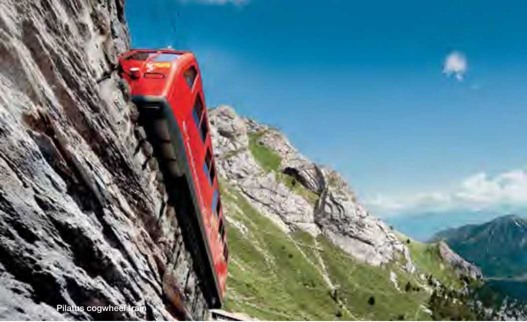
Pilatus cogwheel train