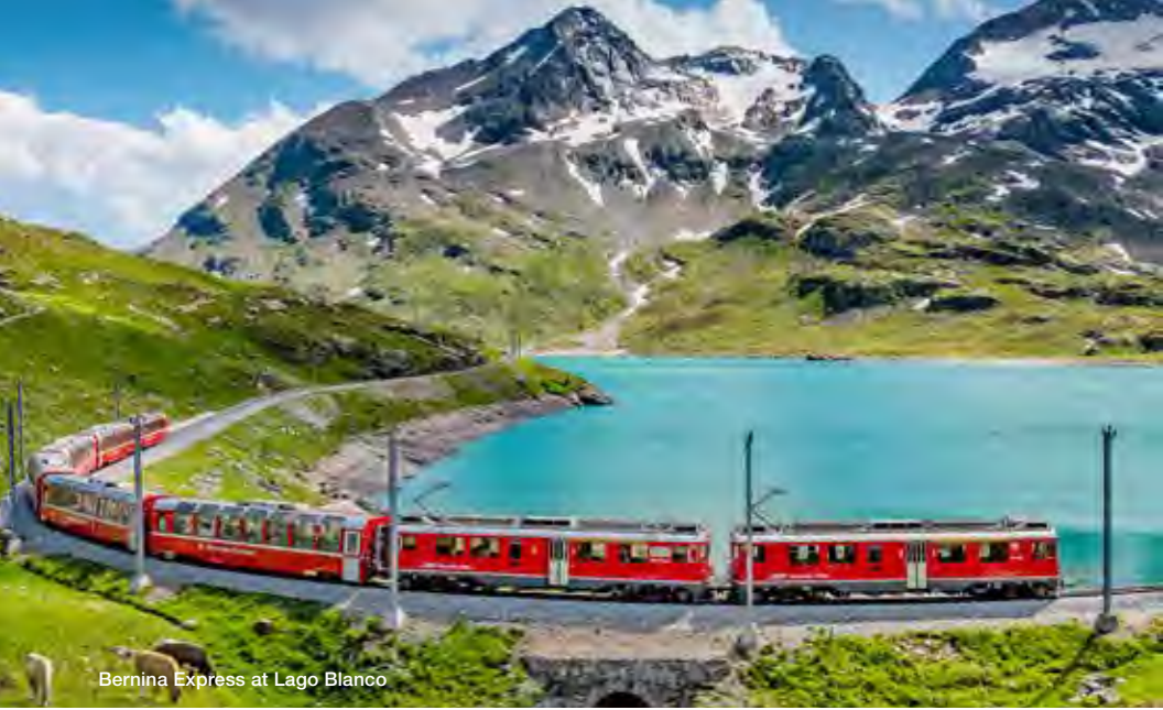
Bernina Express at Lago Bianco