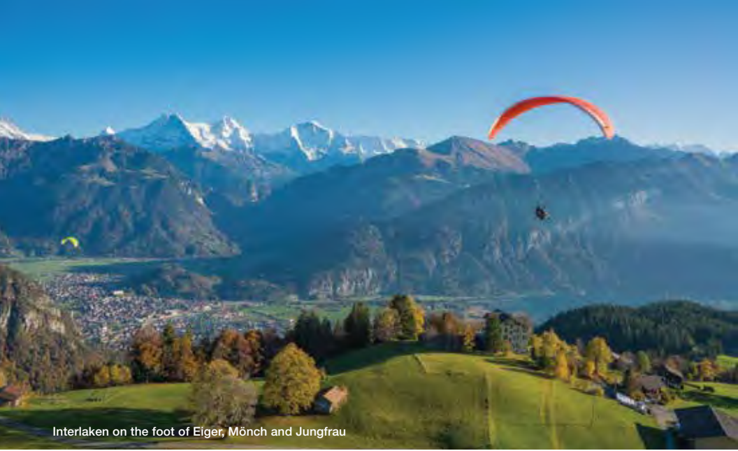
Interlaken on the foot of Eiger, Mönch and Jungfrau