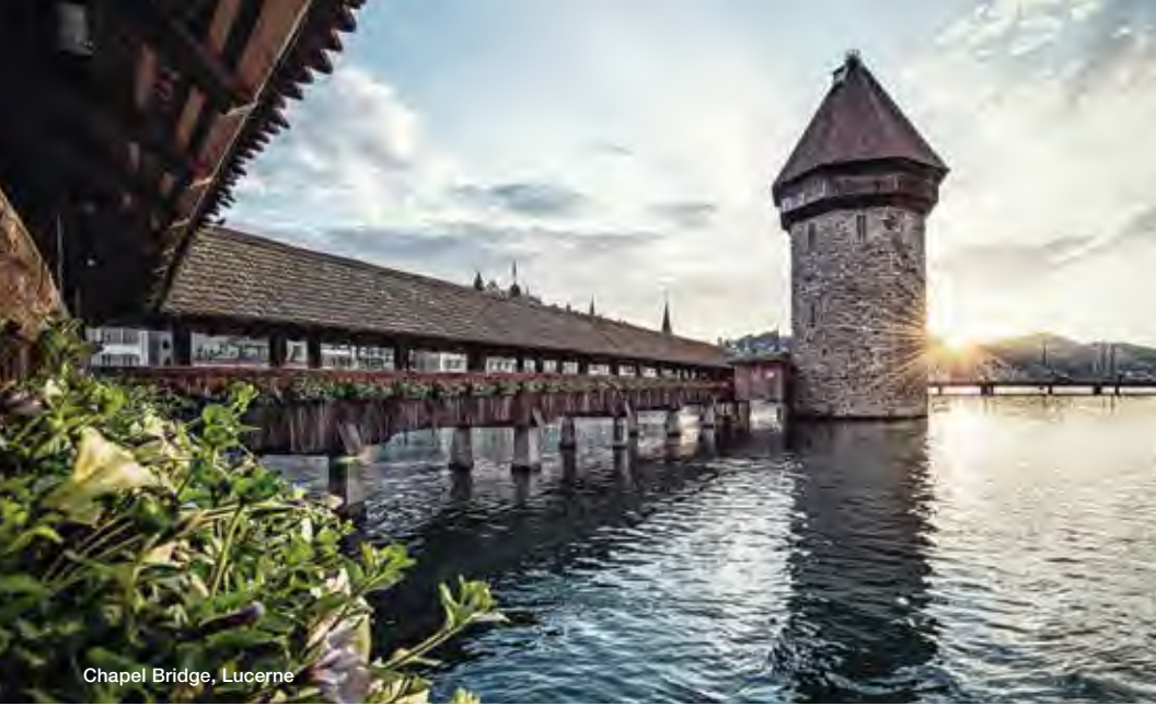
Chapel Bridge, Lucerne