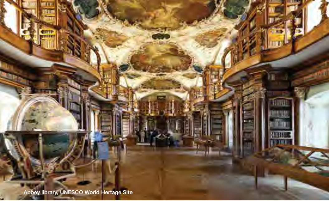
Abbey library, UNESCO World Heritage Site