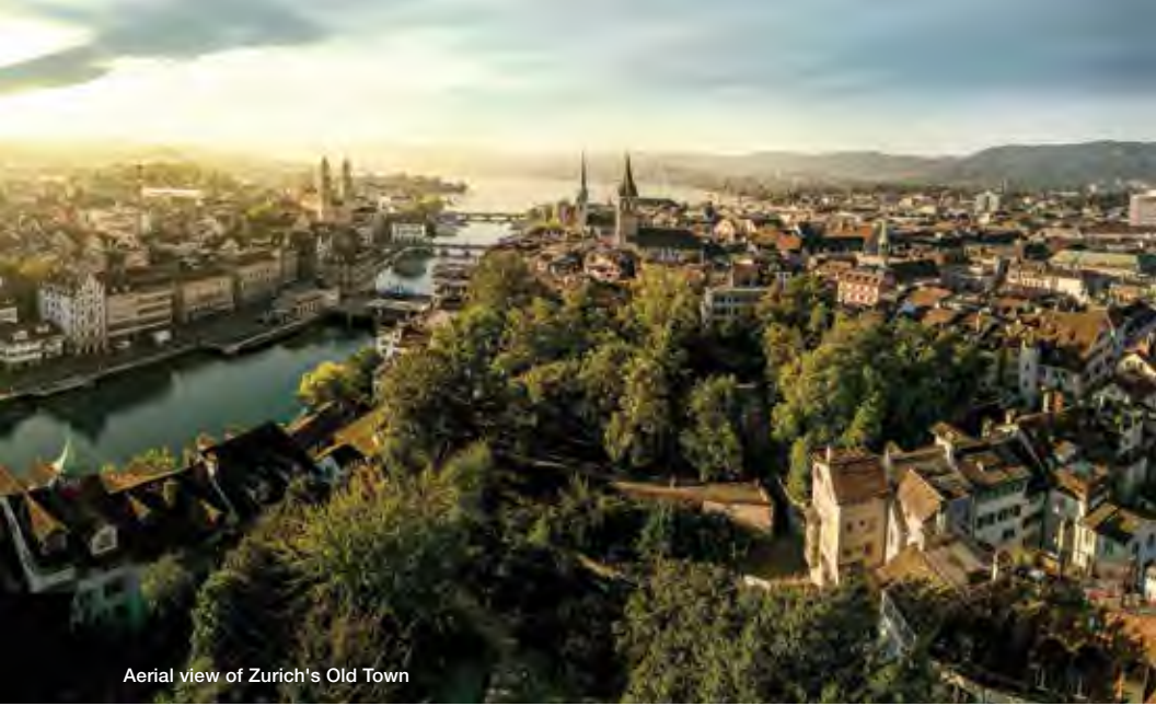
Aerial view of Zurich's Old Town