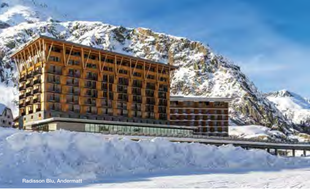
Radisson Blu, Andermatt