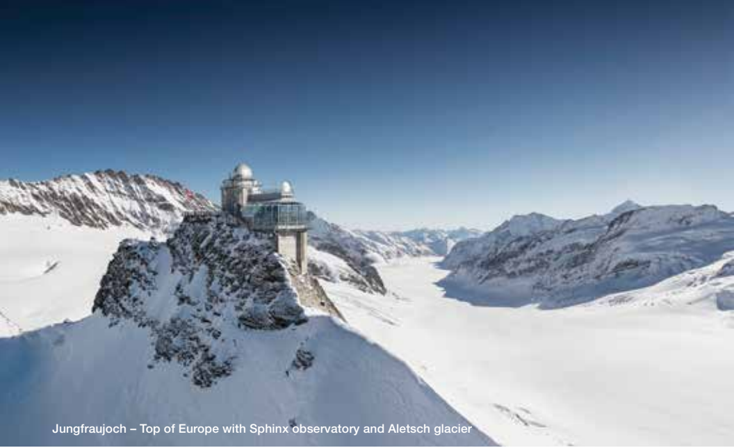
Jungfrauoch – Top of Europe with Sphinx observatory and Aletsch glacier