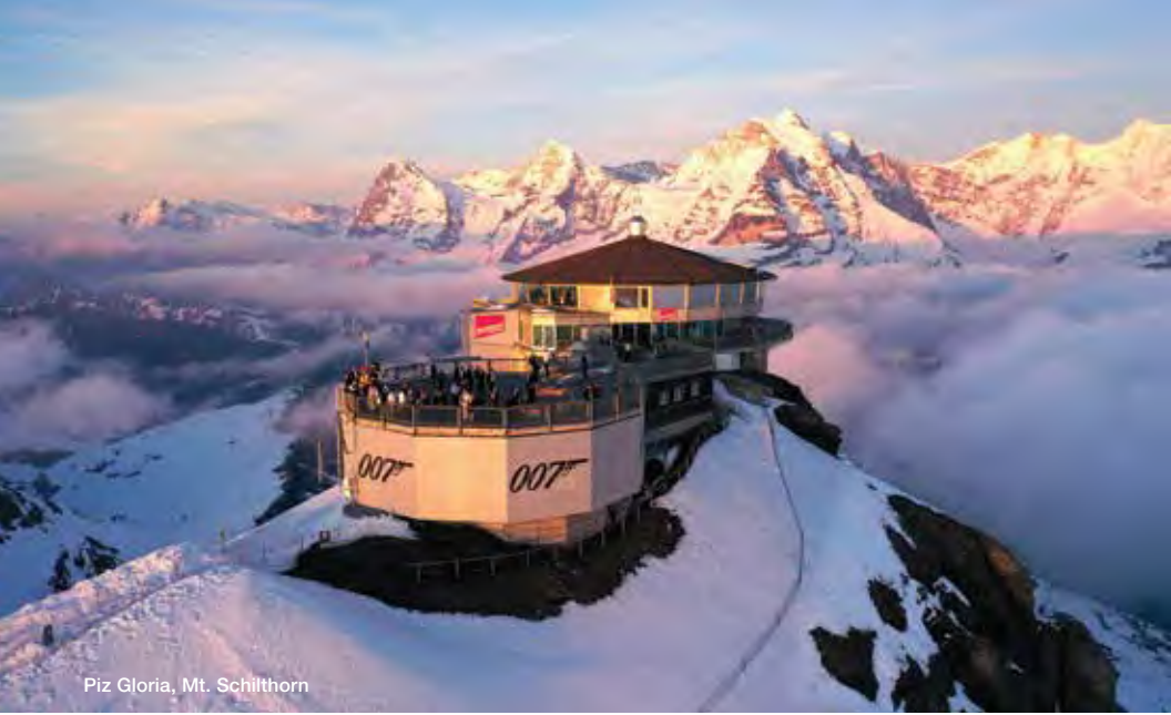
Piz Gloria, Mt. Schilthorn