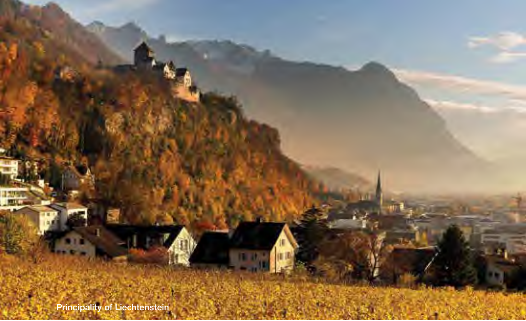
Principality of Liechtenstein