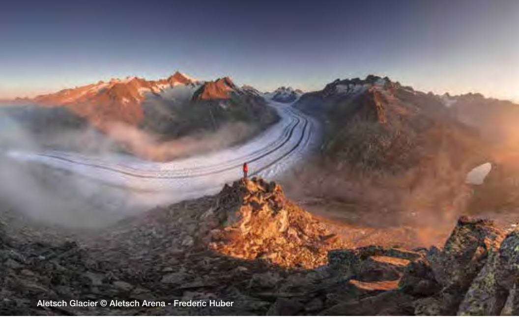
Aletsch Glacier