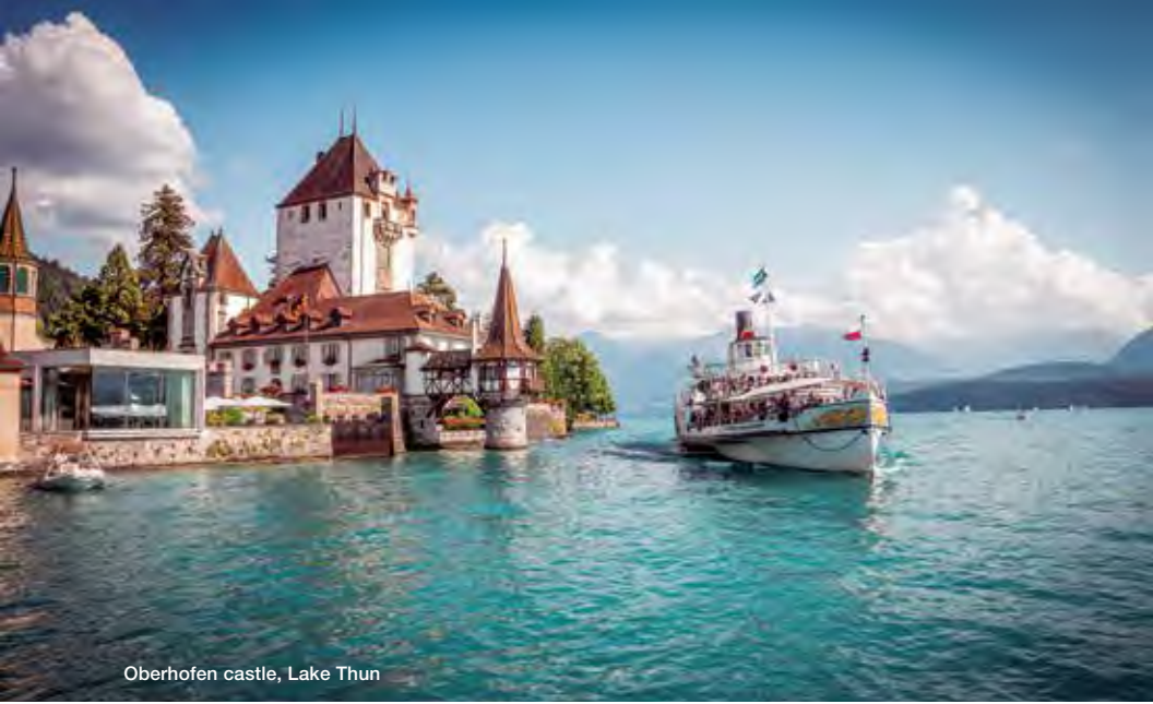
Oberhofen castle, Lake Thun