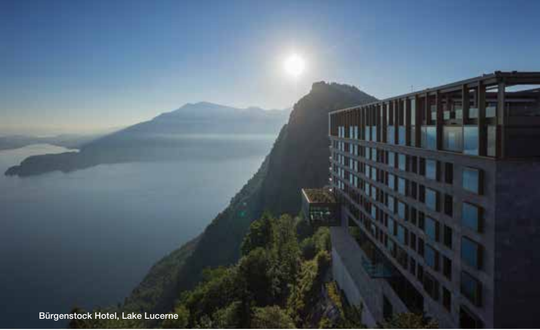
Bürgenstock Hotel, Lake Lucerne