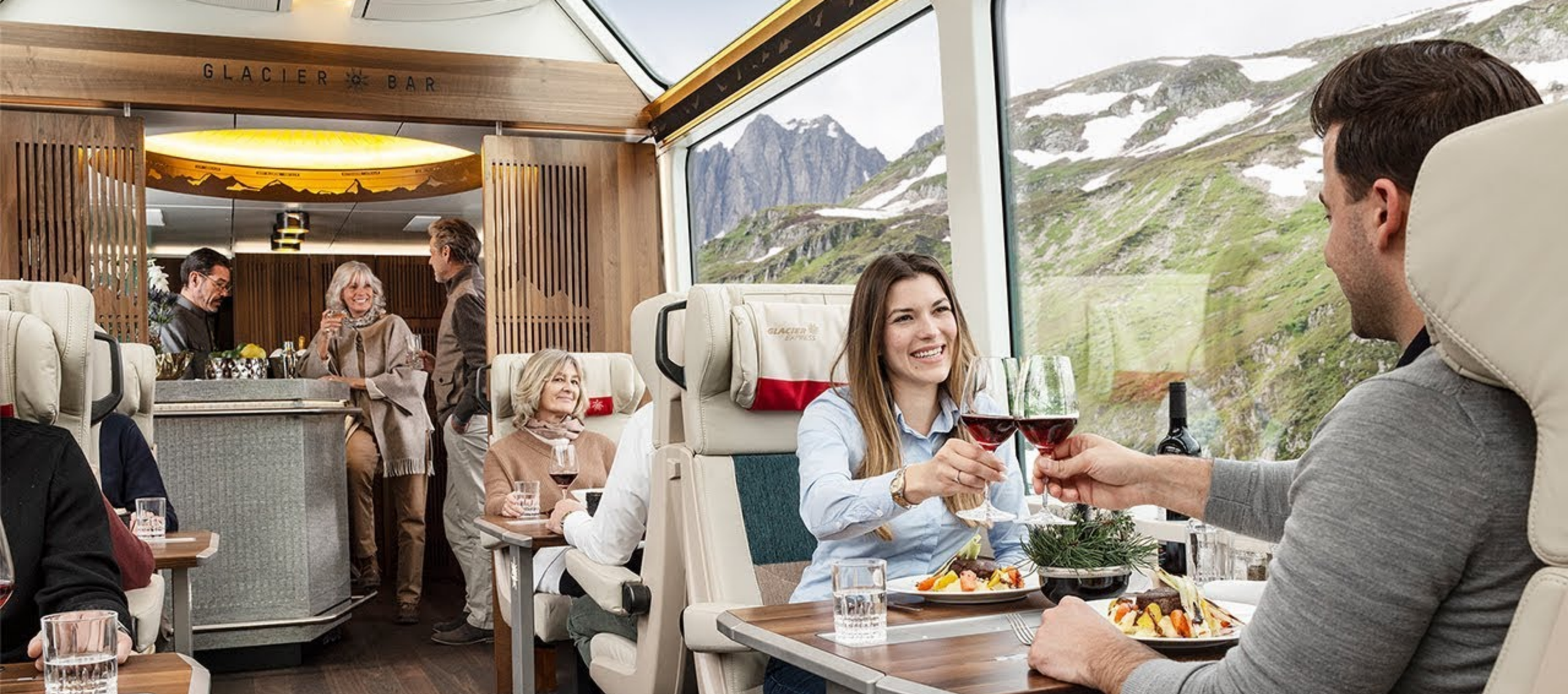
Excellence Class – Glacier Express (St Moritz-Zermatt) 8 hrs