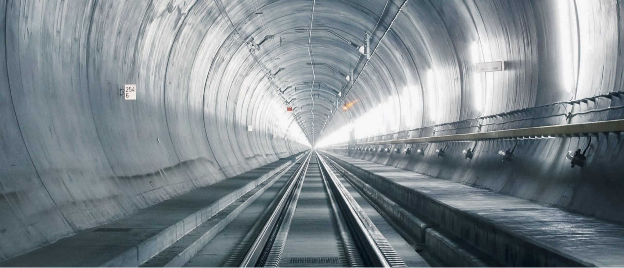
Gotthard Base Tunnel (Zurich-Lugano) – 2hrs 16 min world's longest and deepest rail tunnel