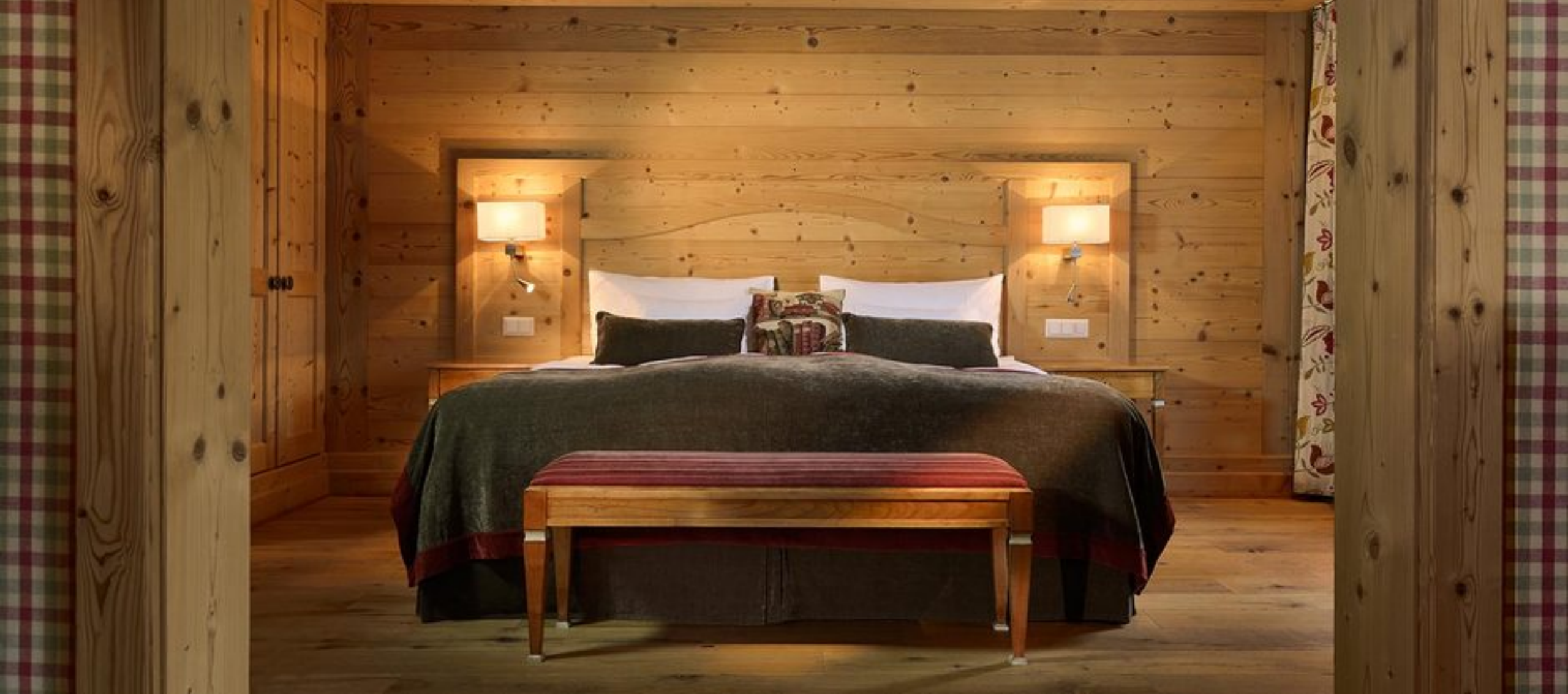
Mont Cervin Le Petit Palace