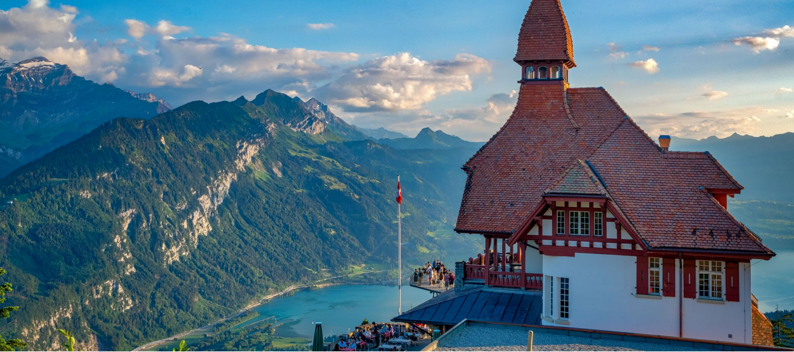
Harder Kulm – Overlooking Interlaken