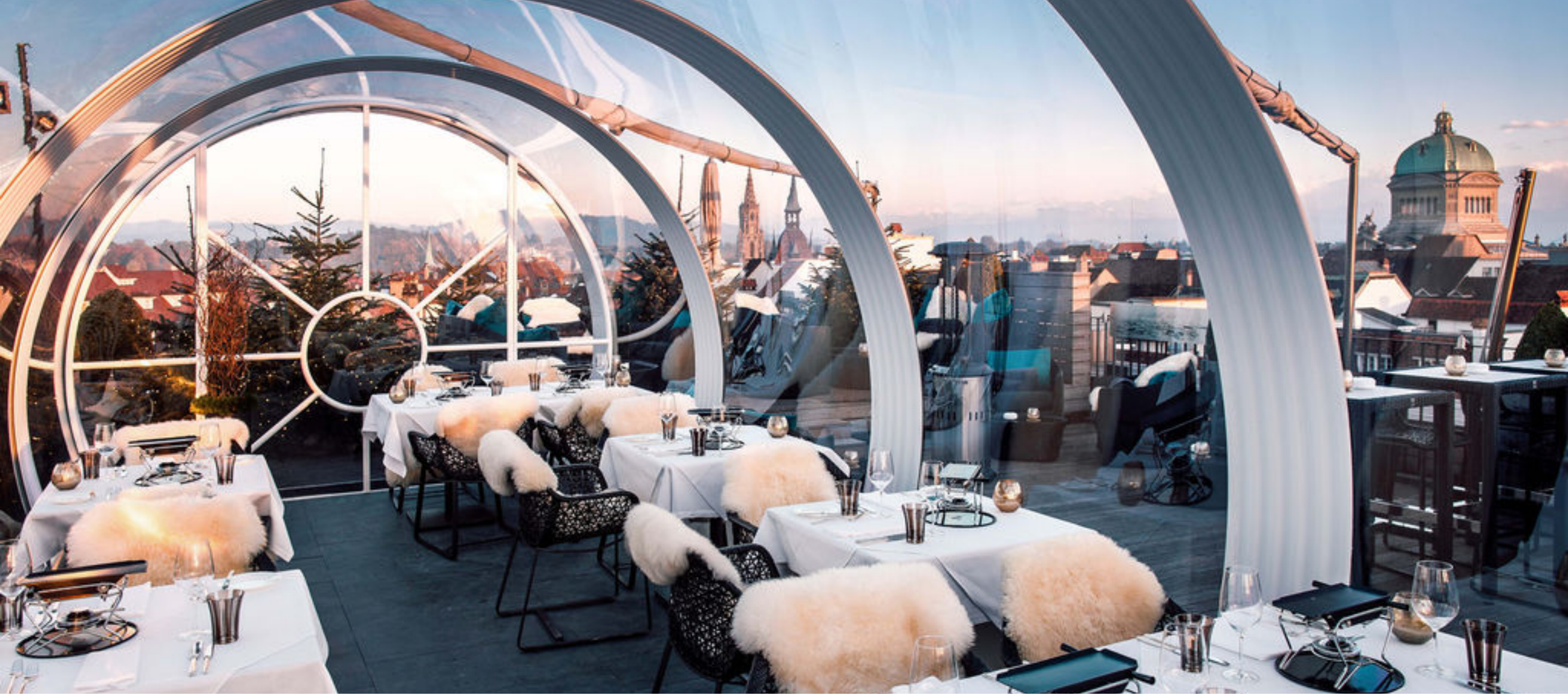
Hotel Schweizerhof- Tubbo on the Sky Terrace