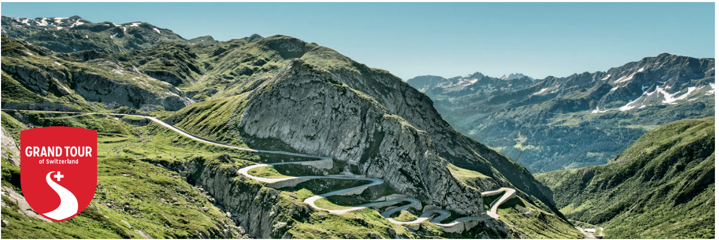
Airolo, Tremola, Ticino