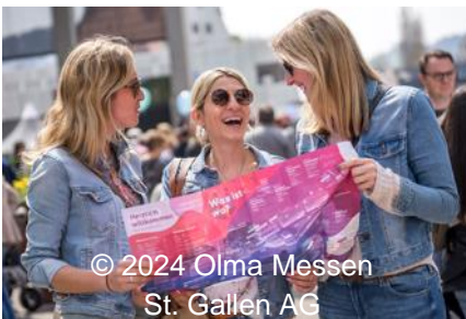
© 2024 Olma Messen St. Gallen AG