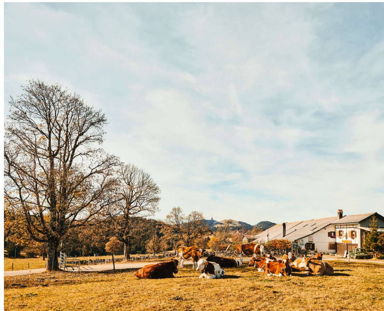
Farmhouse in the bernese Jura