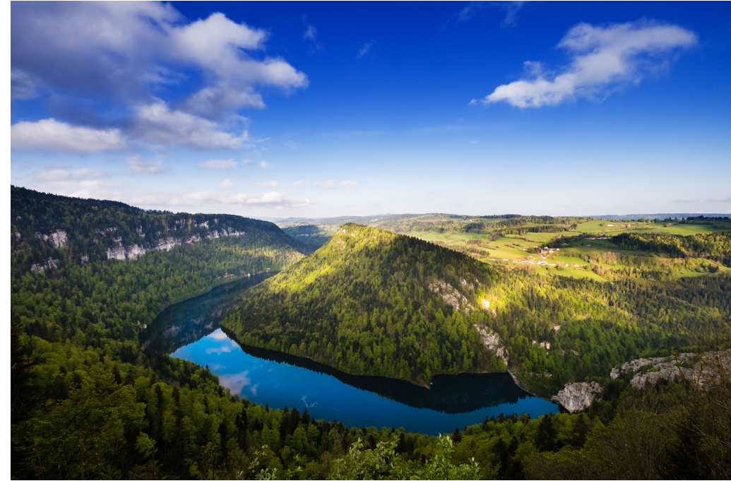
The Doubs river