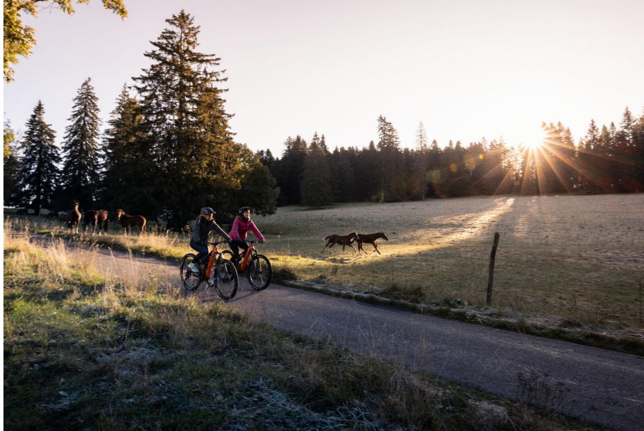
La Gruère pond