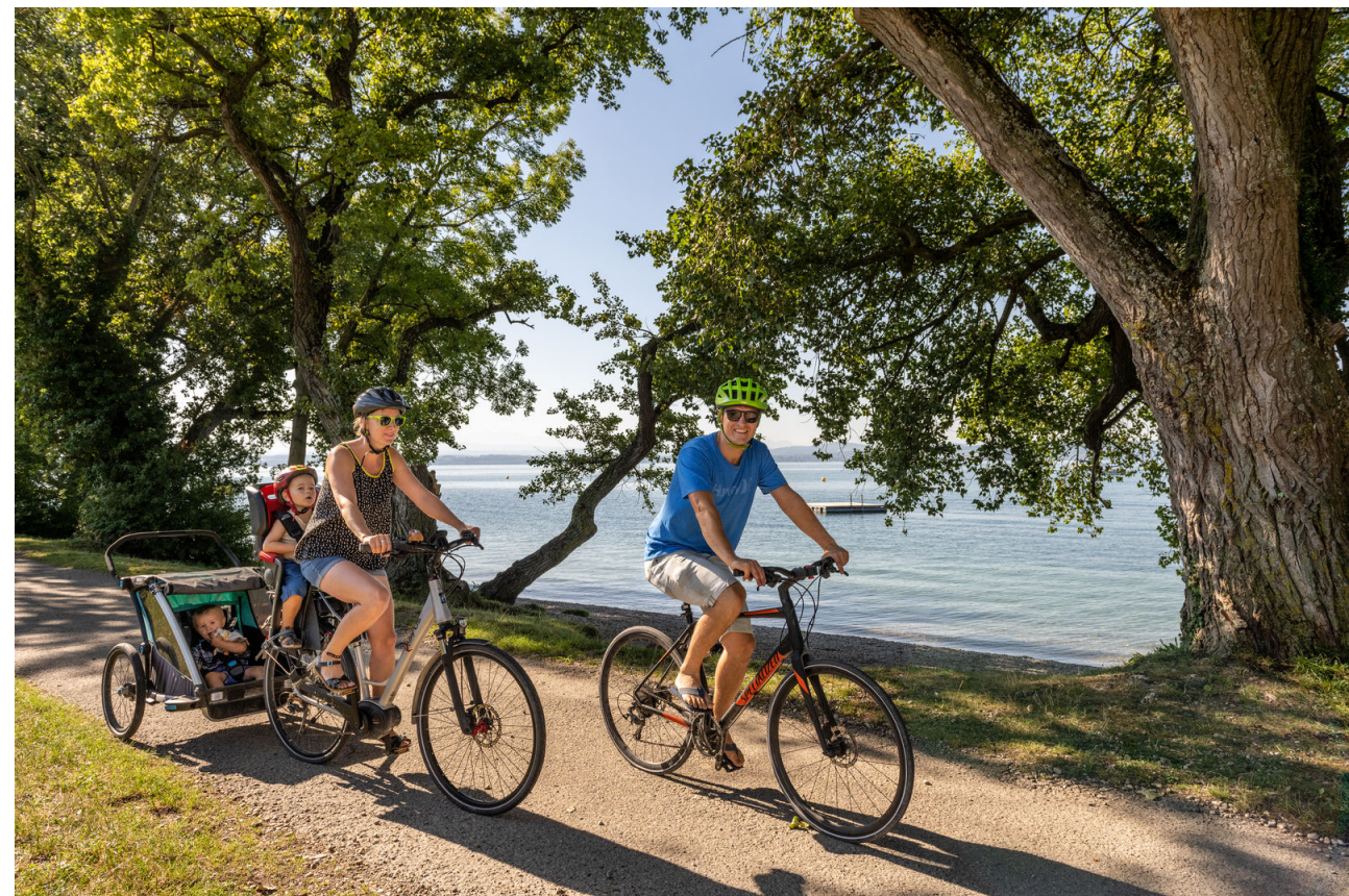
Pointe du Grain beach