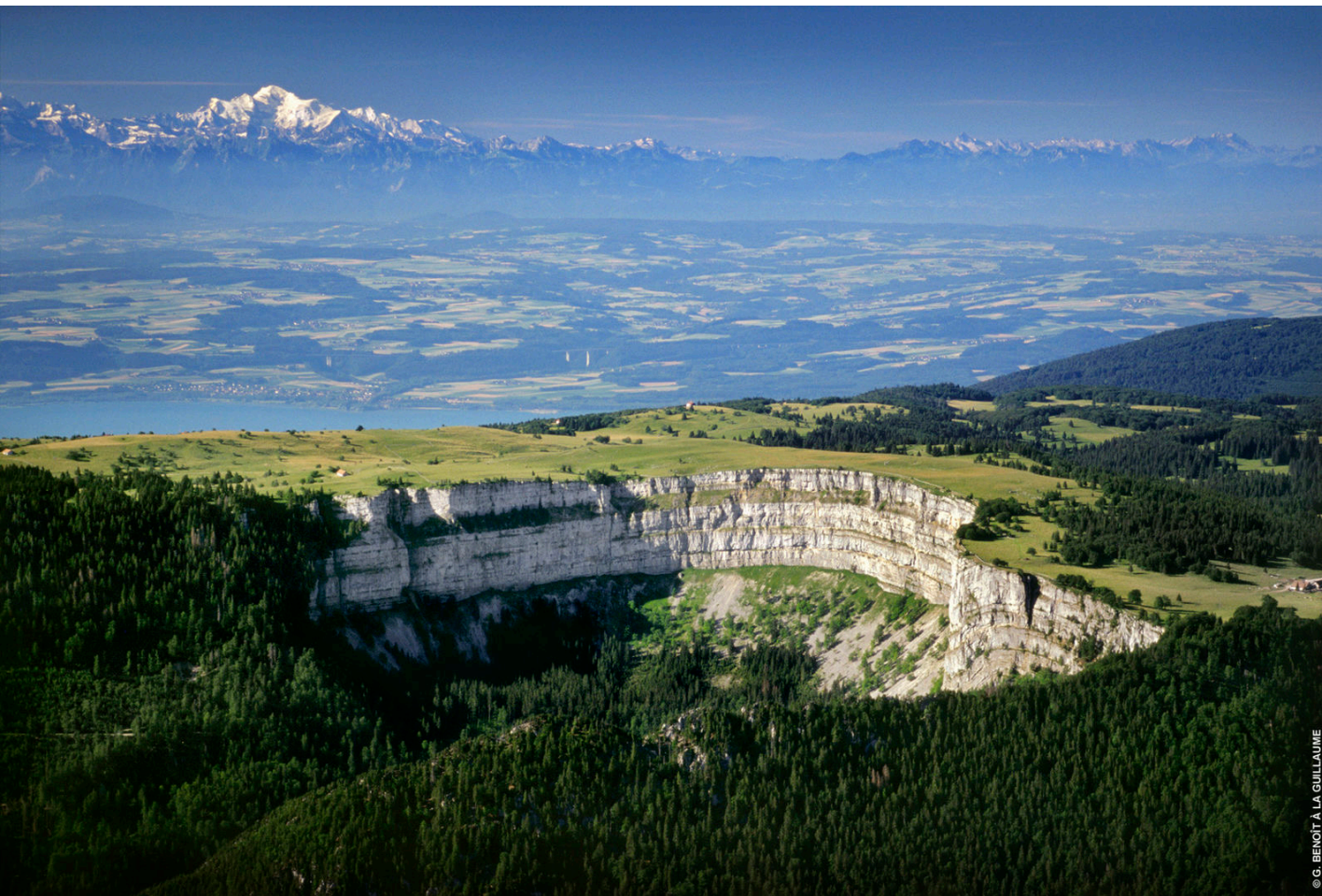
Creux du Van