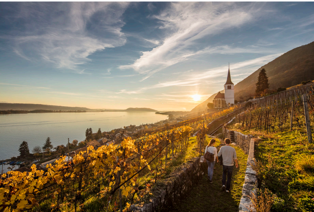
Ligerz (lake Biel)