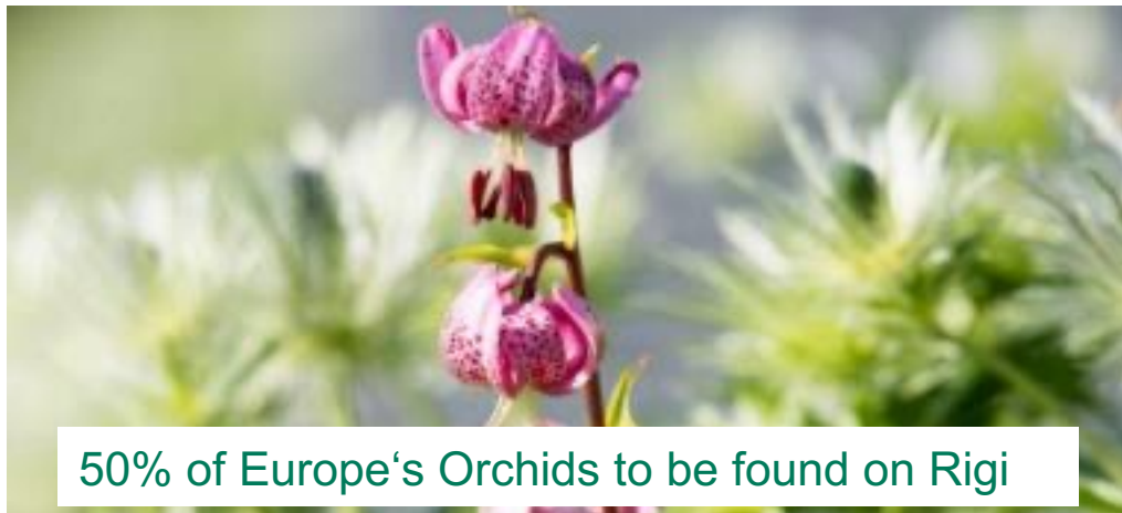
50% of Europe's Orchids to be found on Rigi