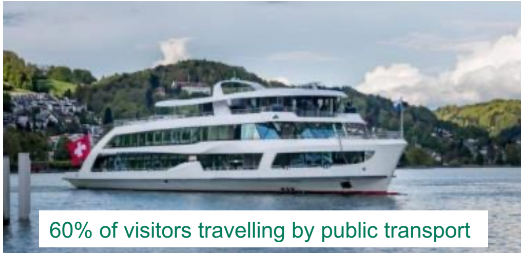
60% of visitors travelling by public transport