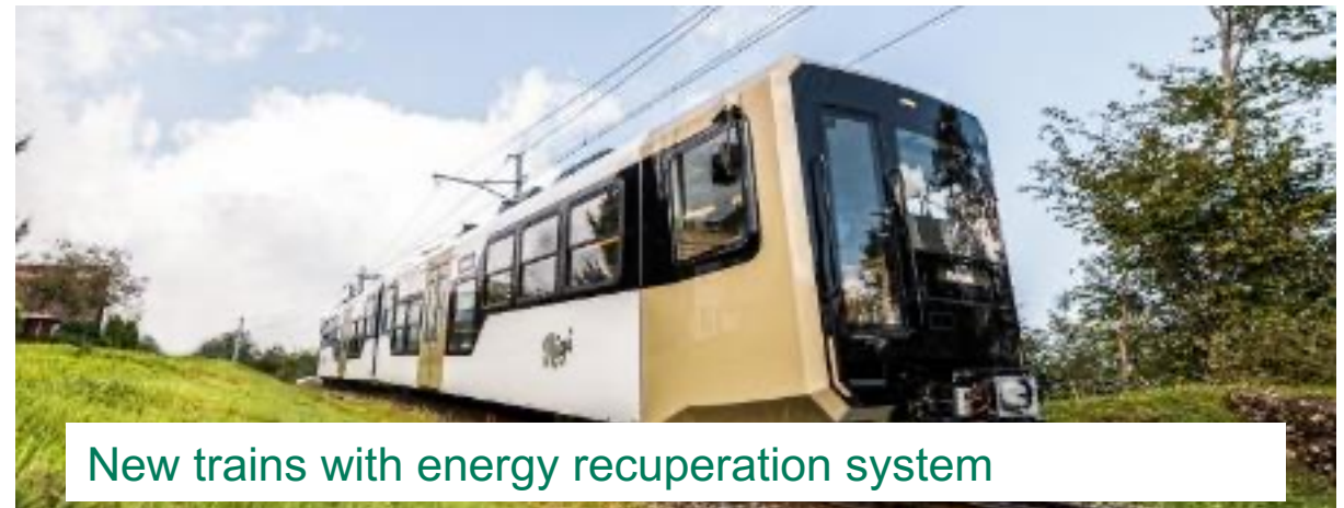
New trains with energy recuperation system