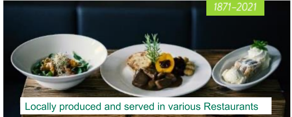
Locally produced and served in various Restaurants