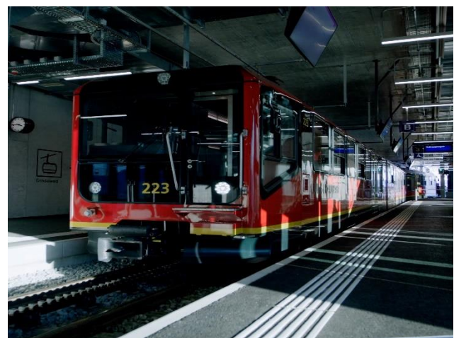
New Station Eigergletscher