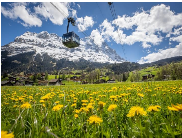
New Gondola Eiger Express