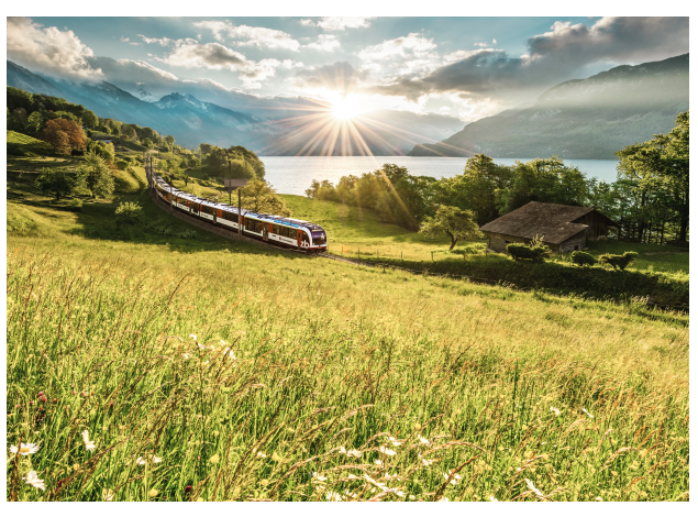
Luzern-Interlaken Express at Lake Brienz, Bernese Oberland