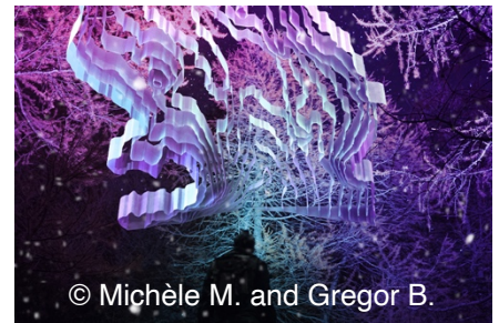
© Michèle M. and Gregor B.

The Magic Forest Lenzerheide is an open-air winter festival in the Grisons mountains. It combines light art, music, culinary delights and a market village. The atmosphere in the forest makes the Magic Forest Lenzerheide a unique experience. Fine music, delicious food and light installations await. Experience the festival here . December 15, 2023 – January 3, 2024