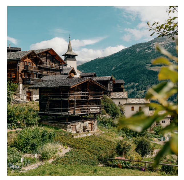
Val d'Anniviers, Grimentz

All programs are conducted in English and the number of participants is limited to a maximum of 10 journalists. Markets that work on the corresponding segments are given priority, and registrations are made on a "first-come, firstserved" basis.