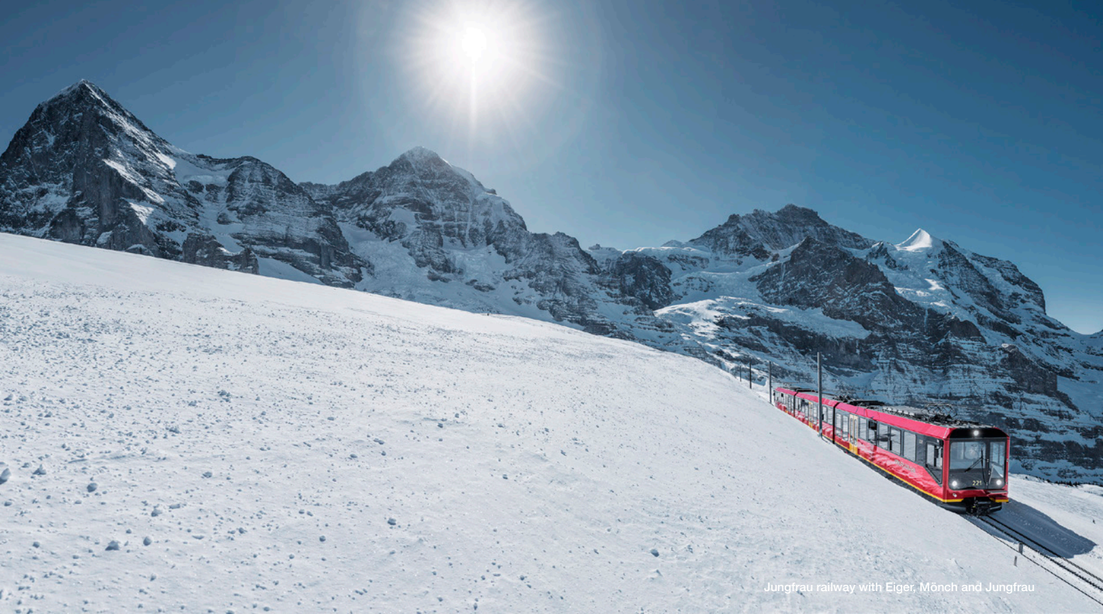
Jungfrau railway with Eiger, Mönch and Jungfrau