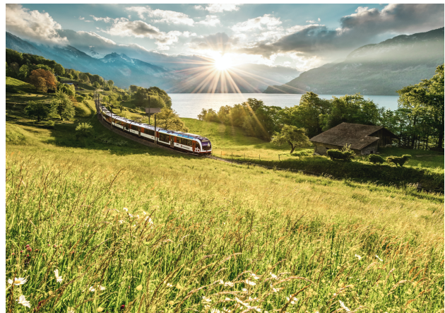
Luzern-Interlaken Express at Lake Brienz, Bernese Oberland, ©Tobias Ryser

The Grand Train Tour even has its own app. Guests choose their dream route and discover all the must-sees along Switzerland's most beautiful railway lines. In addition to receiving push notifications about upcoming sights and landmarks, travellers also get the chance to collect stamps and awards. Those who have collected enough can become "Master of Grand Train Tour of Switzerland". What's more, there are gifts and discounts available in the form of integrated digital coupons. For more information and downloads, see: MySwitzerland.com/traintourapp .