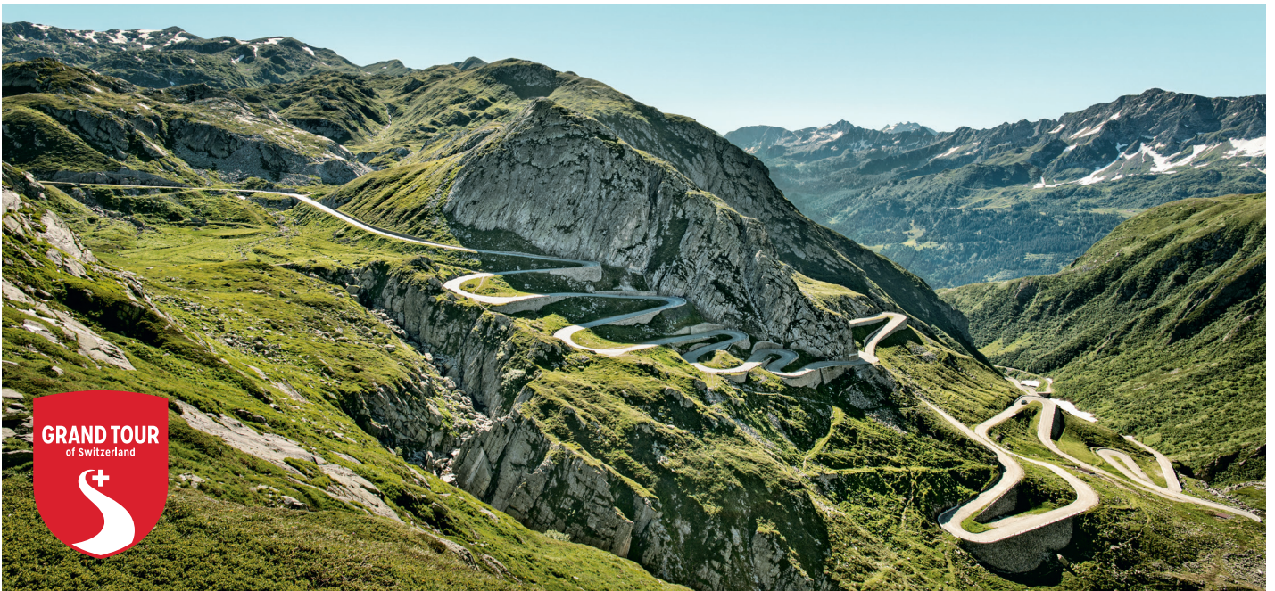
The old Gotthard Pass road Tremola, Ticino