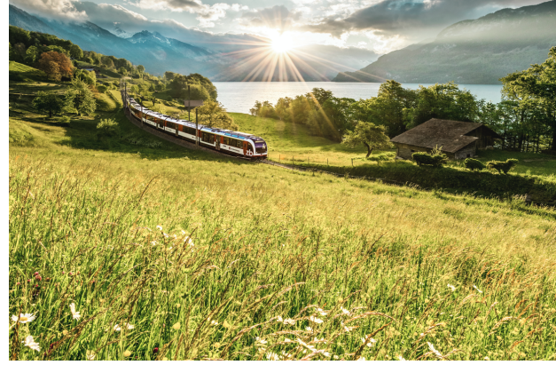
Luzern-Interlaken Express at Lake Brienz, Bernese Oberland, ©Tobias Ryser

The Grand Train Tour even has its own app. Guests choose their dream route and discover all the must-sees along Switzerland's most beautiful railway lines. In addition to receiving push notifications about upcoming sights and landmarks, travellers also get the chance to collect stamps and awards. Those who have collected enough can become "Master of Grand Train Tour of Switzerland". What's more, there are gifts and discounts available in the form of integrated digital coupons. For more information and downloads, see: MySwitzerland.com/traintourapp.